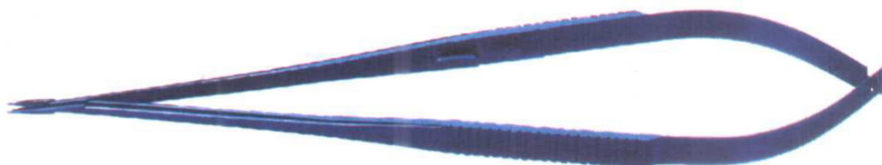
Tungsten carbide coated tips, flat handle