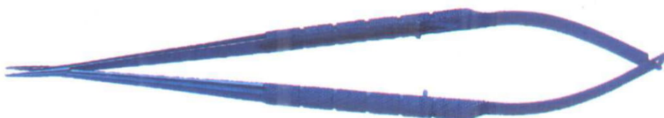
Tungsten carbide coated tips, round handle, multilock