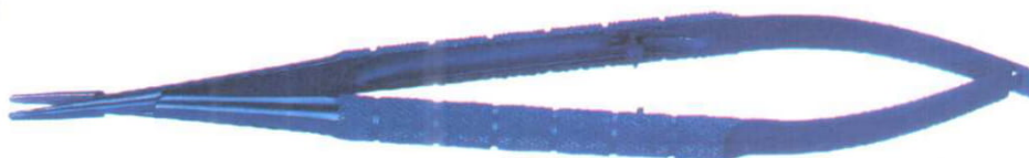
Tungsten carbide coated tips, round handle, multilock