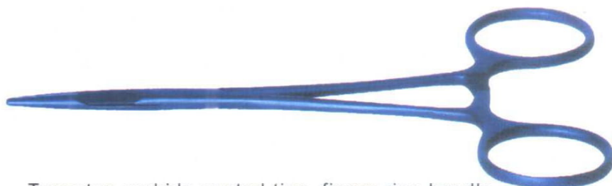
Tungsten carbide coated tips, finger ring handle