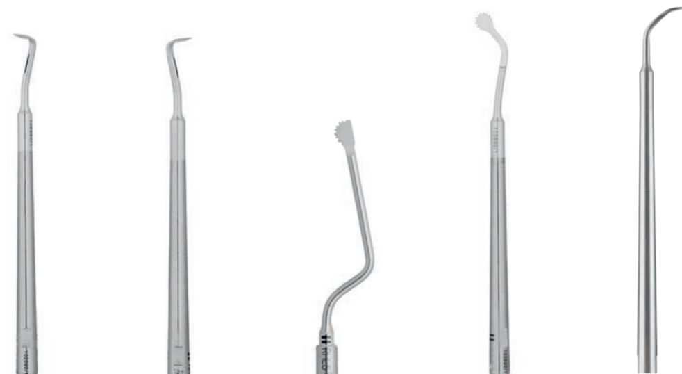
RHL4L** RHL4R** RHL5** RHL6** BS6 XXL