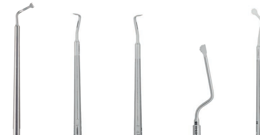
BS1 XXL RHL4L RHL4R RHL5 RHL6