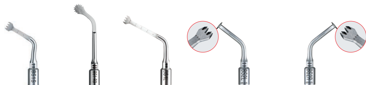
BS1S BS1RD BS1L BS2L BS2R