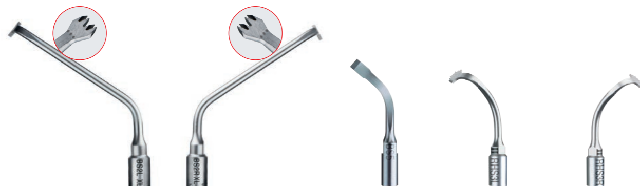
BS2L XL BS2R XL BS5 RHS3L RHS3R