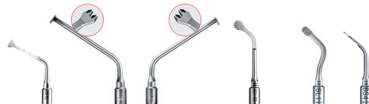
BS1L BS2L XL BS2R XL BS1RD SL1 BS4