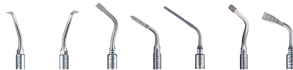
RHS4L RHS4R RHS5 NINJA LC1 XL SL1 CS1